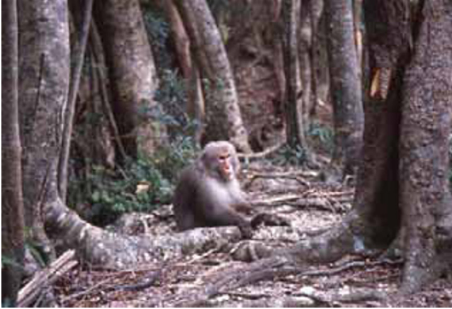
Fig. 1.4 Japanese macaques in the warm-temperate forest at Yakushima Island

in the natural habitats of Japanese macaques everywhere in Japan without provisioning.