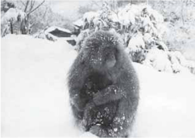
Fig. 1.5 Japanese macaques in the snow at Shiga Heights

to the coldest climate in primate habitats. The foods, feeding behavior, and activity budget of Japanese macaques were investigated during heavy snow in winter (Wada and Tokida 1981; Izawa 1982; Fig. 1.5). Several general surveys including morphology, population genetics, physiology, and ecology were conducted in various habitats, and the adaptive features of Japanese macaques to cold climates were analyzed. Uehara (1977) compared food composition of Japanese macaques among different types of vegetation and found their most common foods occurred in the cool-temperate and warm-temperate forests. He hypothesized that dietary features of Japanese macaques reflect those of their ancestors coming across the Korean Peninsula. Nozawa et al. (1975) collected and analyzed blood samples from macaques captured during the surveys and proposed the “stone-step hypothesis,” meaning that gene flow occurred by male transfers between groups similar to skipping stones on the surface of the water when we throw them. Male Japanese macaques usually leave their natal group and travel a long distance to join other groups (Hazama 1965; Nishida 1966). Nozawa et al. (1991) estimated that two local populations with an intervening distance of more than 100 km were genetically independent.