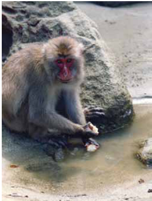
Fig. 1.2 Washing potatoes with seawater at Koshima Islet.