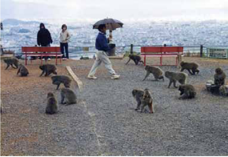
Fig. 1.3 Provisioning of Japanese macaques at Iwatayama Monkey Park in Arashiyama

affected unprovisioned groups by male movements. The larger groups produced by provisioning stimulated more males to transfer into adjacent small groups and changed intergroup relationships (Suzuki et al. 1975; Sugiyama and Ohsawa 1982).