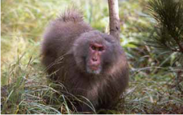
Fig. 1.6 An alpha-male of a small group in the lowland forest at Yakushima Island

daily activity rhythm (Yotsumoto 1976), and the relationship between nutritional intake and energy expenditure in individual female macaques was analyzed from the bioenergetic point of view (Iwamoto 1974, 1982). A significant correlation was found between food quality with group size, daily travel distance, and home range size in both warm-temperate and cool-temperate forests (Ikeda 1982; Furuichi et al. 1982). Takasaki (1981) found a positive correlation between their group size and home range size in both habitats, and that home range size was greater in the cool-temperate forest than in the warm-temperate forest for the same group size.